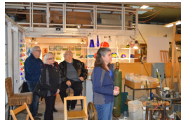
Glass Blowing Class