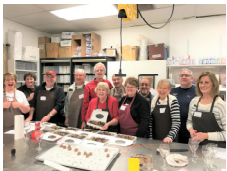
Chocolate Making Class

The Club attends other Corvette club car shows and meetings throughout Washington